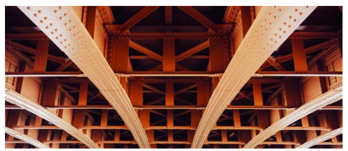
Corrosion protection systems