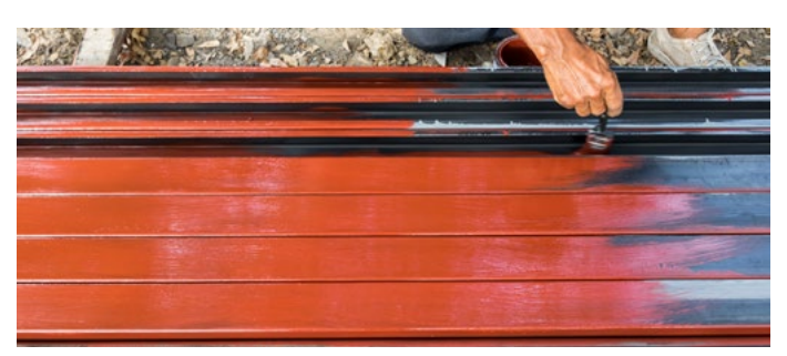
Coating systems, waterborne and conventional