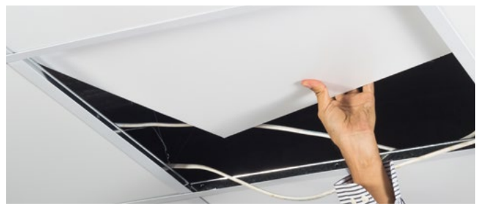
Silicate panels ceiling constructions