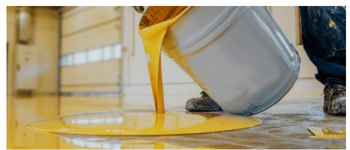
Building chemistry, plasters & thick-film systems