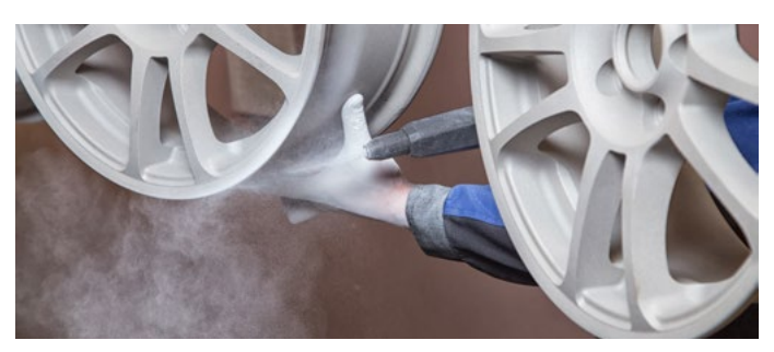
Powder coatings and resistance